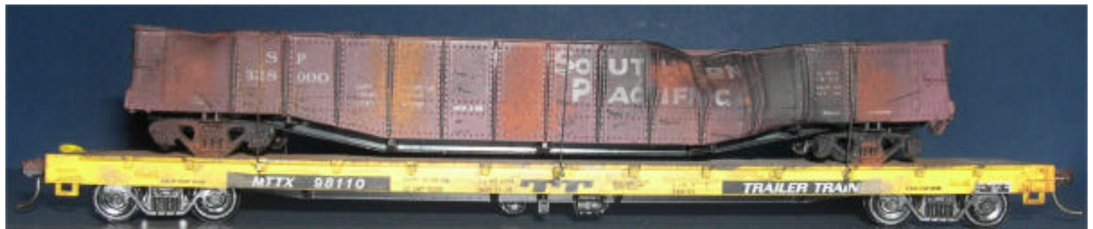
2nd place, Alan Hutchins