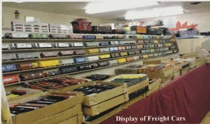
Display of Freight Cars