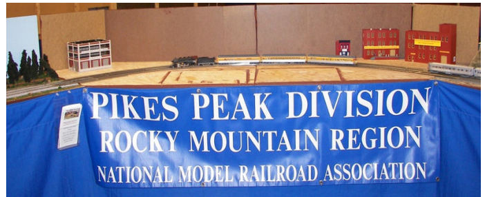
The divisions new inside corners at the June TECO show.