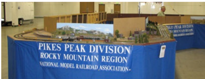
The new high line corner is on the left side and the corner module with the start of the high line is on the right with a new back drop that needs painted.