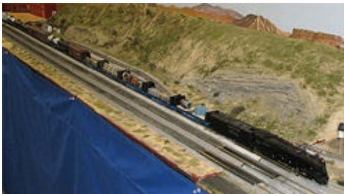
This Santa Fe northern is working hard pulling a train containing open loads.