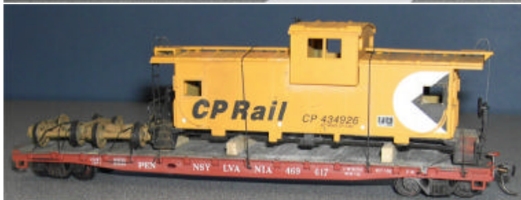
Second Place - Alan Hutchins