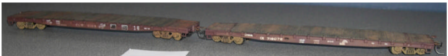
First Place - Alan Hutchins